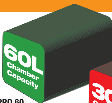
V-PRO 60 Sterilizer