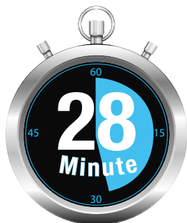
Non Lumen Cycle

Multiple Cycles - Having the right cycle for the right instrument means your medical devices are ready when you need them.