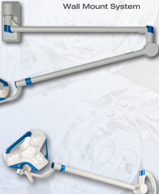
Wall Mount System