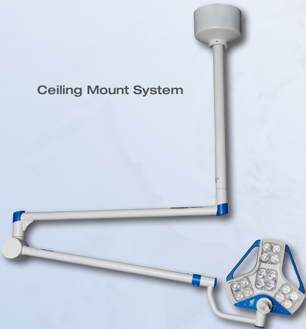
Ceiling Mount System

Flexibility in mounting and location within the room allow for Customer Adaptability