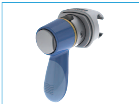
Rail-infusion rack clamp Ref : TAB 741