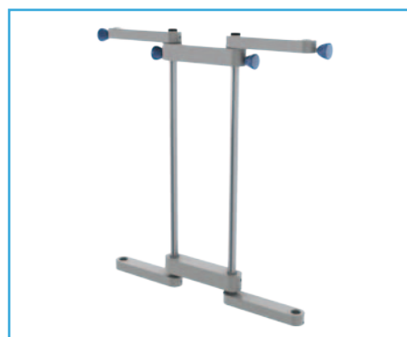
Quad support for infusion rack for distribution column Ref : SUP 41