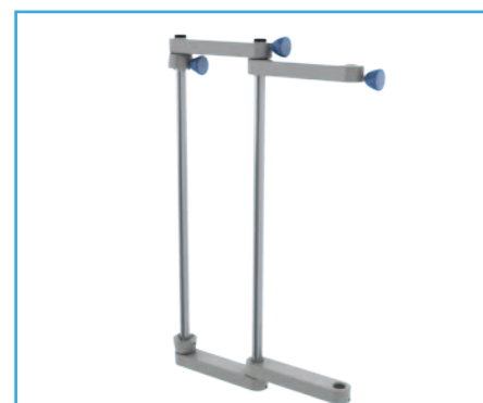
Triple support for infusion rack for distribution module Ref : SUP 32