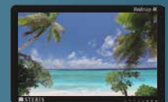
Monitors available in HD or 4K, from 31 to 65 inch