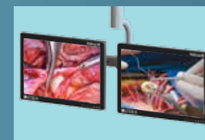
Spring arm and simple or dual monitor holder