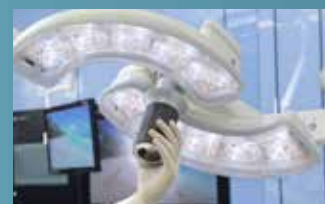
HD camera handle