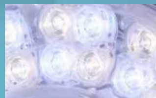
3 500 K - 4 000 K 4 500 K - 5 000 K